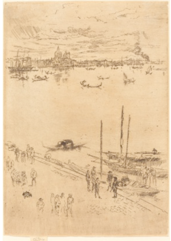
Whistler, James McNeill, Upright Venice , 1880, Etching, 25.5 x 18 cm, National Gallery of Art, Washington, Rosenwald Collection