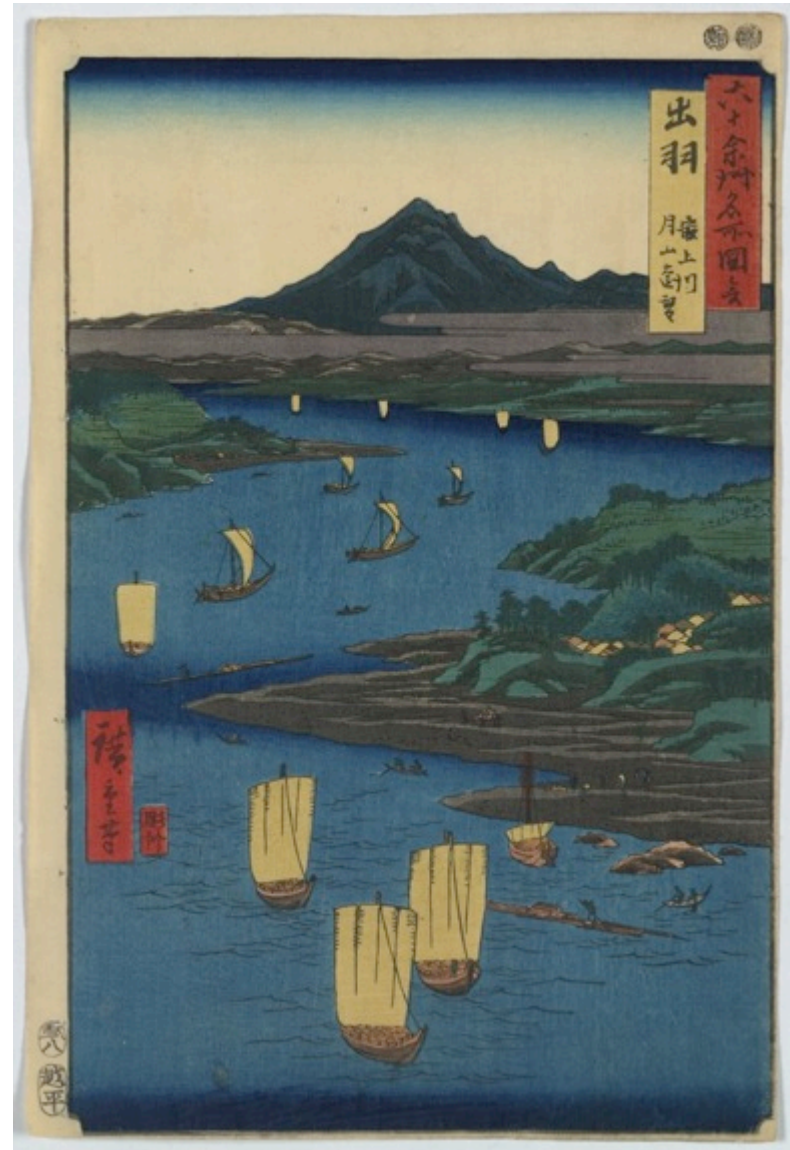
Andō Hiroshige, View of Mogami River and Gassan Mountain, Dewa , 1853, Woodcut, color, 35.8 x 24.1 cm, Prints and Photographs Division, Library of Congress