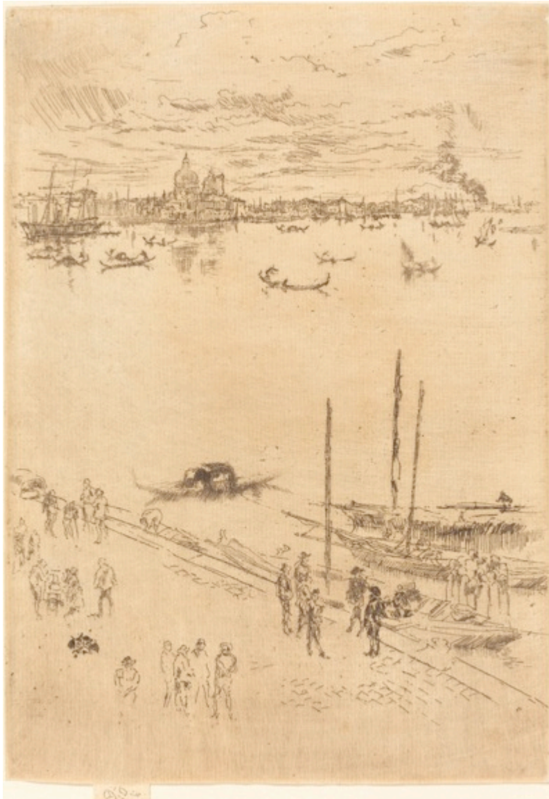
Whistler, James McNeill, American, 1834 – 1903, Upright Venice , 1880, Etching, 25.5 x 18 cm, National Gallery of Art, Washington, Rosenwald Collection